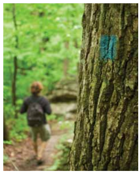
Blue blazes mark the Perimeter Trail. White blazes mark side trails.